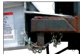
15" OVERLAP INTO TRAILER/BUILDING SAFETY CHAINS STANDARD