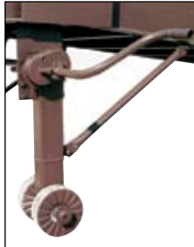
MANUAL HAND CRANK & 9" STEEL WHEELS

Quickly load and unload trucks, trailers and rail cars from ground level when no freight dock exists. Increase productivity while reducing material handling costs. Great for construction sites. A manual two-speed hand crank for easy one person height adjustment offers a service range of 45" to 62". Available in 30 foot of straight ramp or 36 foot overall length; 30 foot of straight ramp and 6 foot level off. Standard features include: 9" steel wheels, positive traction open steel grating, safety locking chains, 4" high steel safety curbs, rubber bumpers, 15" overlap lip, and welded steel construction. Painted neutral earth-tone brown.