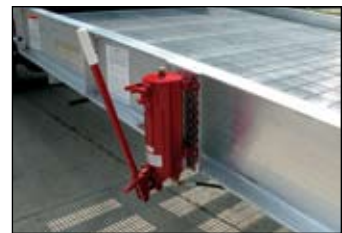
HAND PUMP HYDRAULIC LIFT STANDARD