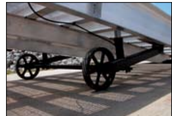
18" x 5" MOLD-ON-RUBBER TIRES ARE STANDARD