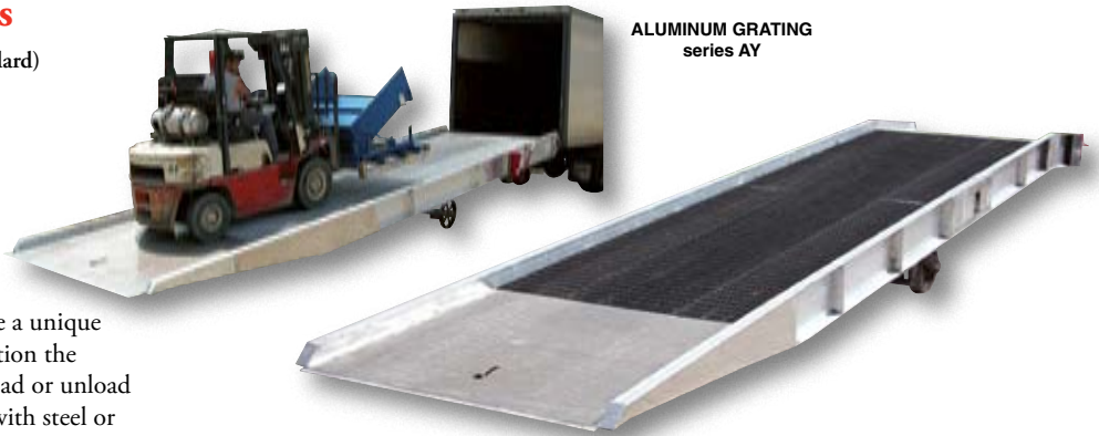
ALUMINUM GRATING series AY

Portable Aluminum Yard Ramps have a unique design that allows one person to position the ramp, adjust its service height, and load or unload trailers from ground level. Available with steel or rust resistant aluminum grating.