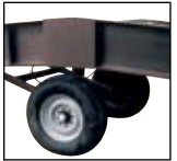
27" PNEUMATIC TIRES