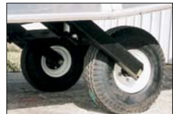
PNEUMATIC TIRES OPTION Service Range will be 40" to 66" model AY-PNTR model SY-PNTR