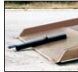
TOW BAR HITCH model YR-TB-H