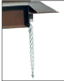
SAFETY LOCKING CHAINS WITH 15" OVERLAP LIP