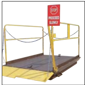
STOP SIGNAL SIGN model WL-SSS