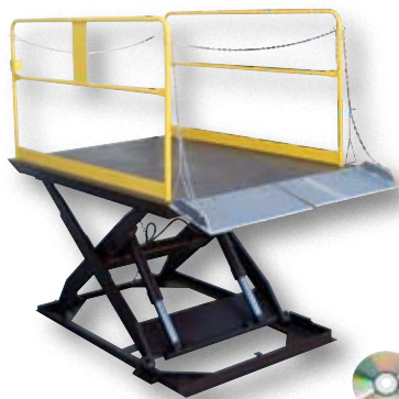
Shown with Optional Aluminum Bridge