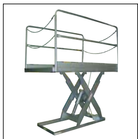
GALVANIZED FRAME AND DECK model SPO-WL-LS-ZRC