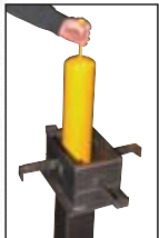
SELF STORING model BOL-SS-42-5.5