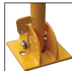
FOLDING BOLLARD model BOL-FD-36-Y