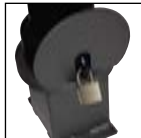
REMOVABLE ORNAMENTAL BOLLARD model BOL-OR-40-BK