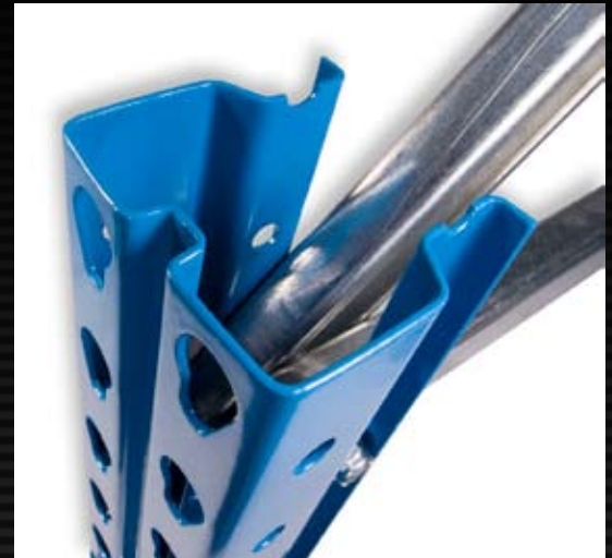
KONSTANT engineers have developed North America's finest Bolted Rack system.