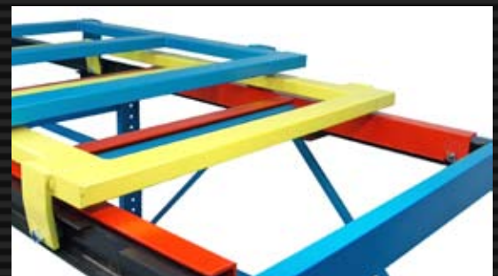
KONSTANT Push Back is recognized as the best in the industry.