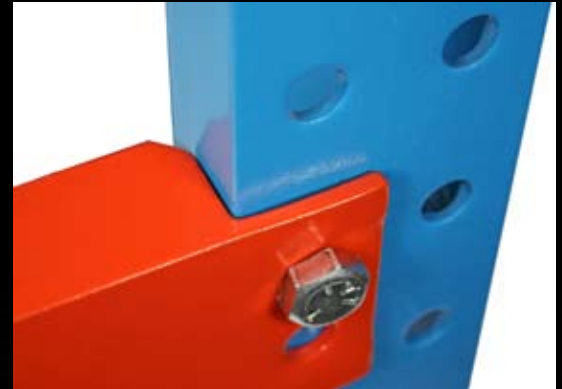
The KONSTANT structural Beam to Column connection is simple, dependable and strong.

Our customers put it best when they say, "KONSTANT rack systems are simply the best."